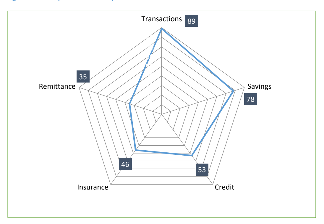
Figure 3: Landscape of Access example